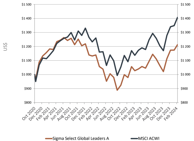
Illustration showing growth of $ 1000 investment at date of inception 1