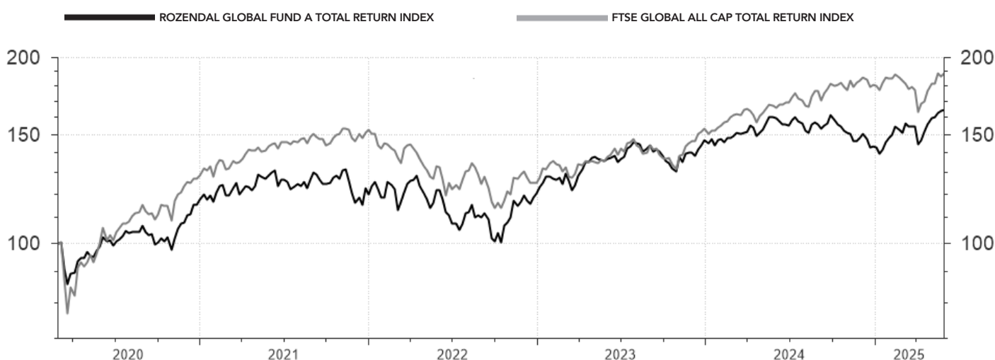
RELATIVE RETURN VS. BENCHMARK (REBASED TO 100)